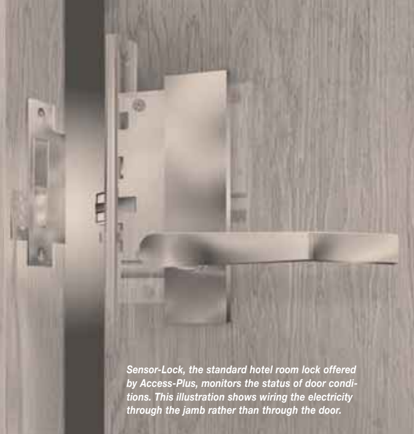
Sensor-Lock, the standard hotel room lock offered by Access-Plus, monitors the status of door conditions. This illustration shows wiring the electricity through the jamb rather than through the door.

Access-Plus® On-Line Security not only keeps real-time communication between rooms and the front office, it helps manage the property with employee time performance reports and increases the safety of your guests with Sensor-Lock™ monitoring technology. Use the chart below to compare and contrast some of the differences between on-line and off-line features.